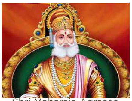
Shri Maharaja Agrasen Seva Sansthan