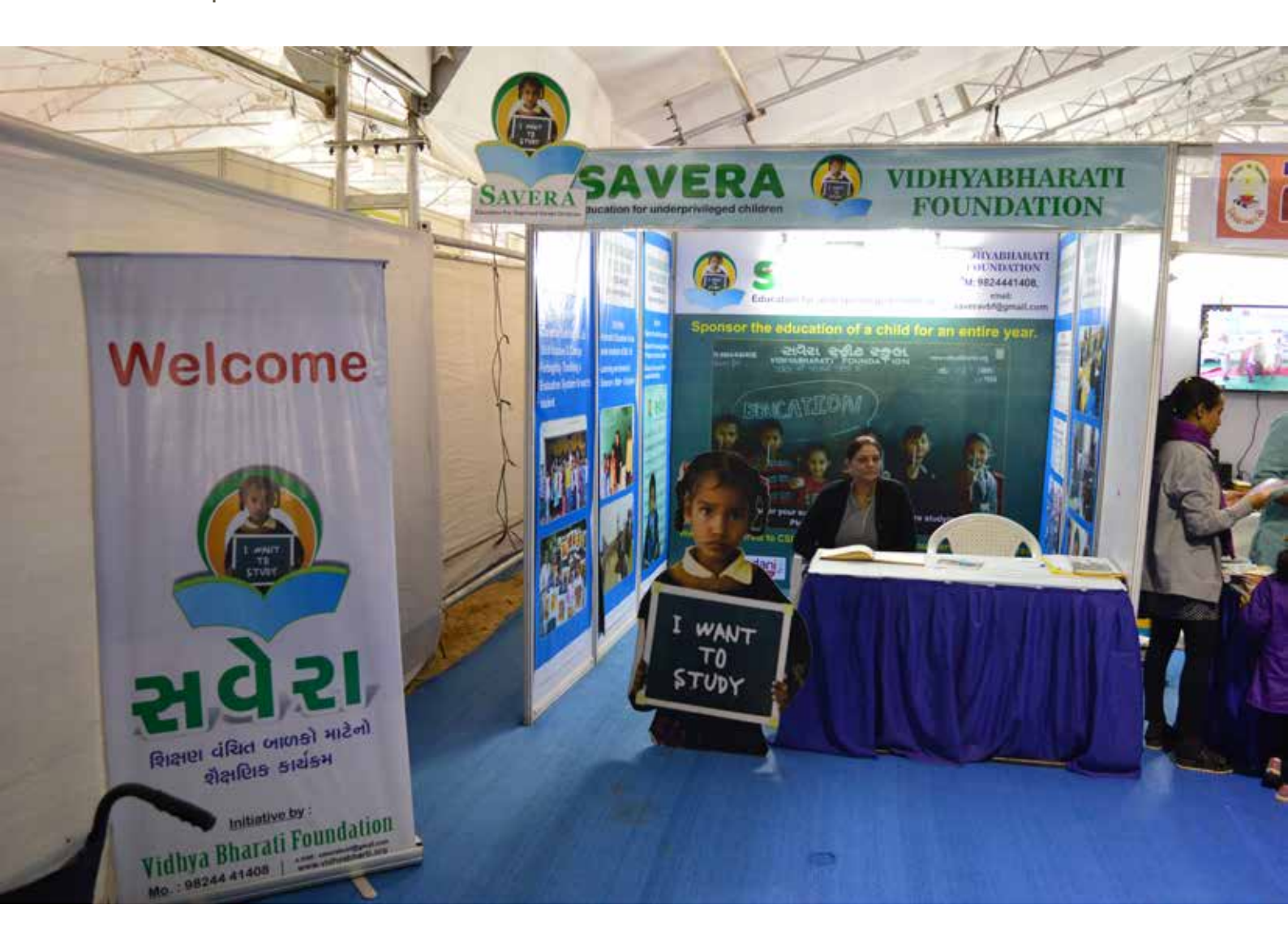
Date: 2-5, February, 2018, Venue: GMDC Ground, Ahmedabad

The event was organized to showcase the contribution of spirituality and services for the development of human and largely the society. The organizer has provided the stall of exhibition to exhibit the activities of various voluntary organizations of Gujarat. Vidhyabharti Foundation had participated in exhibition and exhibited its activity in the stall to the visitors.