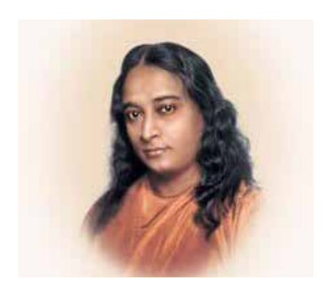
Shri Paramhansa Yogananda Charitable Trust